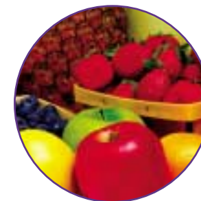
16.77 million colour mode