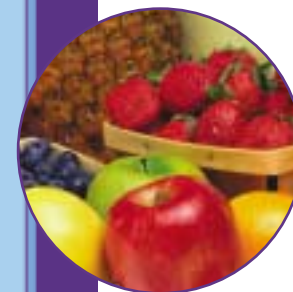
2 million colour mode

Depending on the image displayed, the CMP307XE can be set to reproduce in either 2 million or 16.77 million colours. The 2 million colour mode is more suitable for textural information and improves picture contrast, whereas the 16.77 million colour mode gives better colour reproduction for graphic or video display.